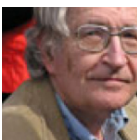
Noam Chomsky MIT Professor Political Analyst