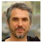
Alfonso Cuarón Orozco Filmmaker "Y tu Mama Tambien" ...