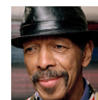
Ornette Coleman Musician Saxophonist and Composer