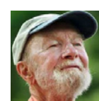
Pete Seeger folk singer political activist