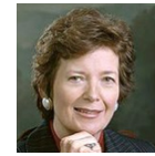
Mary Robison former President of Ireland, former United Nations High Commissioner for Human Rights