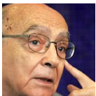
José de Sousa Saramago Nobel Literature Prize Laureate