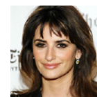
Penelope Cruz Actress