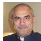
José Manuel Ramos- Horta East Timor's second President Nobel Peace Prize Laureate