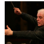
Daniel Barenboim Conductor