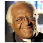
Desmond Tutu Nobel Peace Prize Laureate