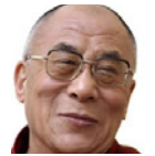
Dalai Lama Nobel Peace Prize Laureate