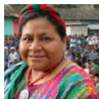
Rigoberta Menchú Nobel Peace Prize Laureate