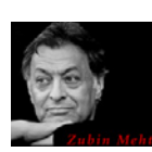
Zubin Mehta Conductor