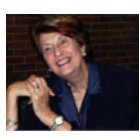
Dr. Helen Caldicott Australian physician, Founder of several antinuclear associations