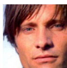
Viggo Mortensen Cinema-Theatre Actor