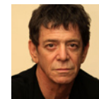
Lou Reed Rock Musician