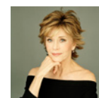
Jane Fonda Actress