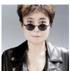
Yoko Ono Artist and Musician